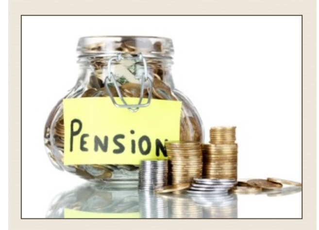
Dalhousie's pension is healthy, funded at 99% on a going concern basis.

The Dalhousie Administration matches that amount and makes additional contributions to ensure the health of the pension. In total, the Administration contributes approximately 12.5% of the total salary budget to the pension fund. For example, if your salary is $100,000 a year, you contribute approximately $8,000 to your pension each year and the Administration contributes approximately $12,500 each year on your behalf.